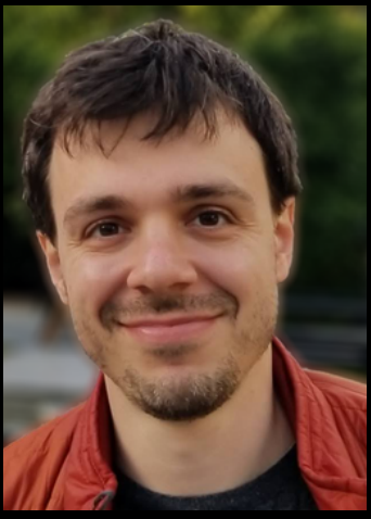
ZACK BOGER FDITOR